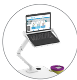
Laptop arm + bracket