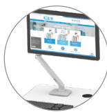
Articulated monitor arm