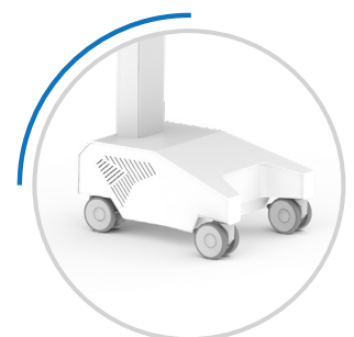
Integrated on-board battery

Can be adapted to suit your specific PC model